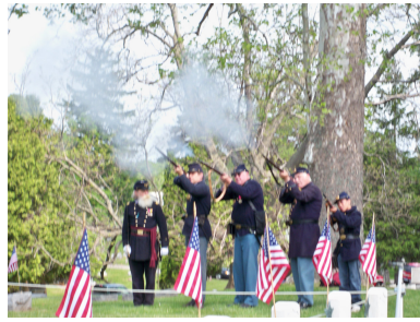
Mount Hope Cemetery