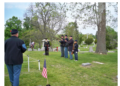
Mount Hope Cemetery