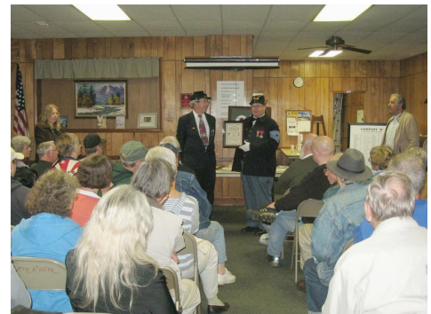
A well deserved certificate our largest crowd ever