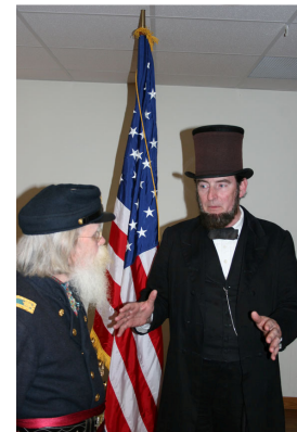
Makes you wonder what year it is