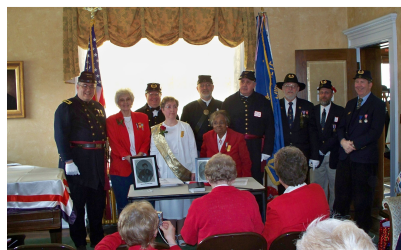
Son's in attendants