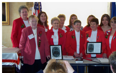
Our new sister's of Tent #30