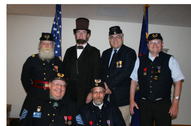
Program at George W. Anderson Camp No. 58