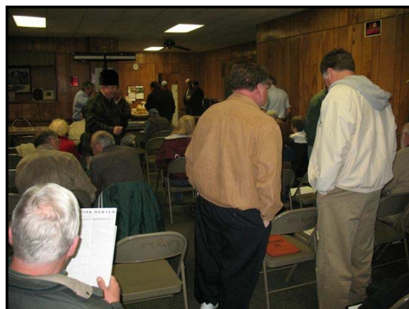
Some of our current Camp Members