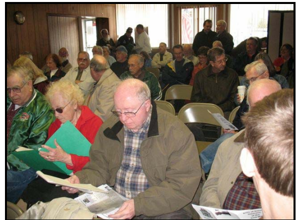
Some of the Crowd