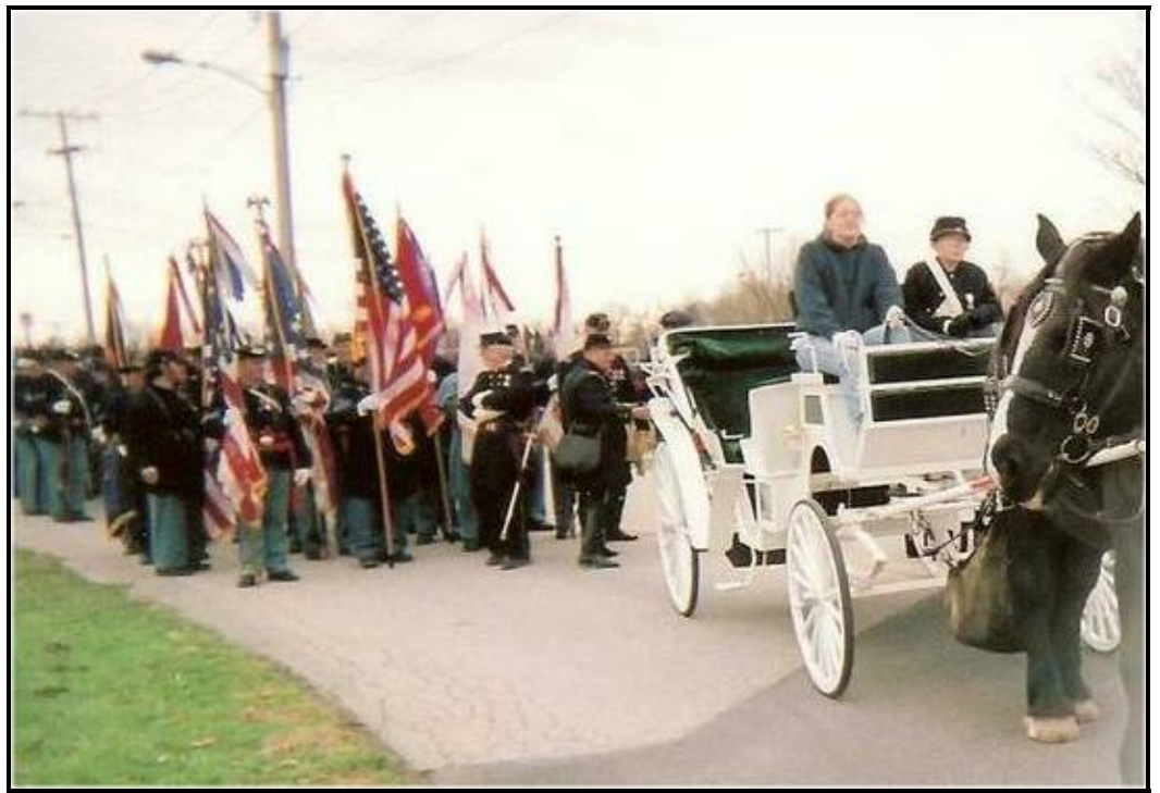
A little boy who had his wish come true (from "Make-a-Wish") to participate in the Remembrance Day Program. The Boy was made a junior in the Order (His SUVCW medal is visible on his The sack coat).