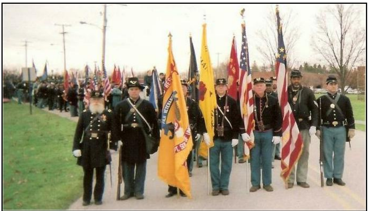
Front file of Michigan Color Guard for the Commander-in-Chief