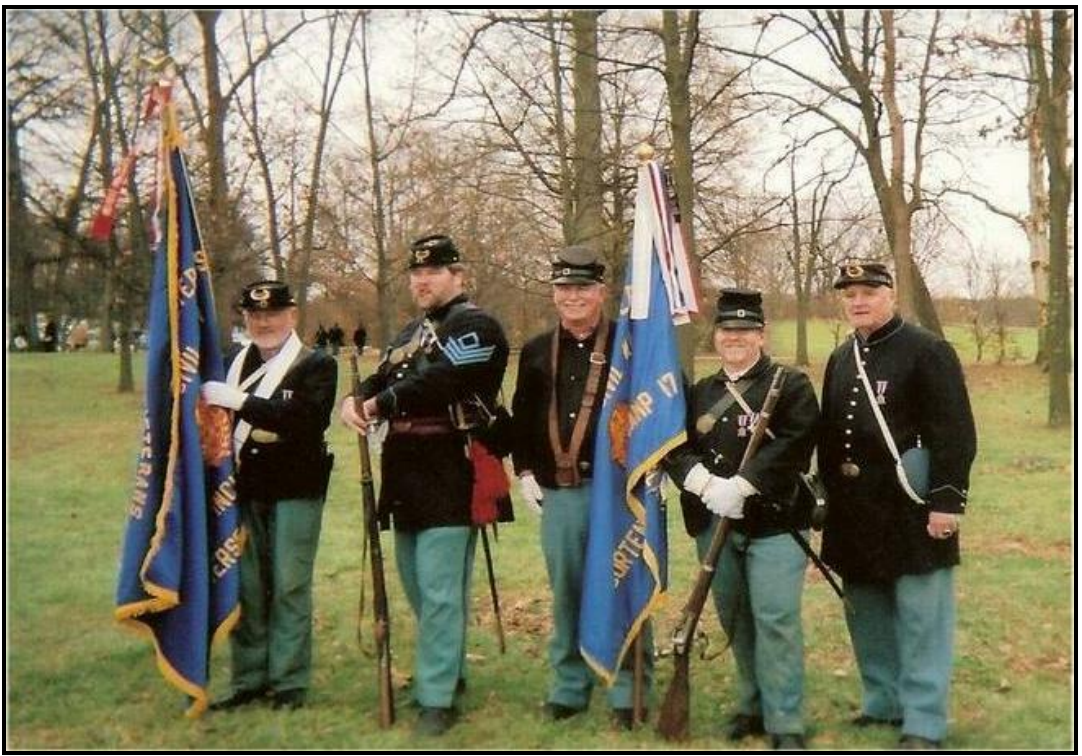
More of the Michigan Color Guard