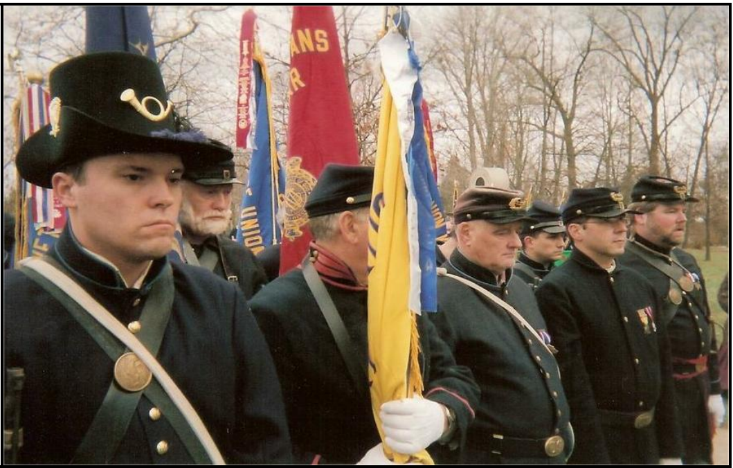
A portion of the Michigan Color Guard at Woolson Monument Program