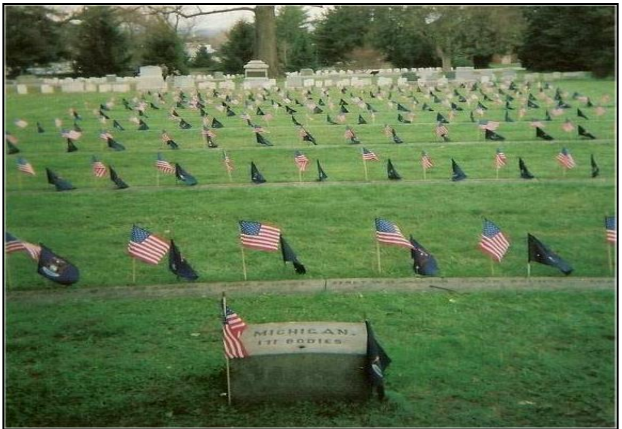
A portion of the Michigan soldier's graves at Gettysburg with U.S. and Michigan flags placed.

Some Photographs from the Remembrance Day Celebration at Gettysburg November 18, 2006