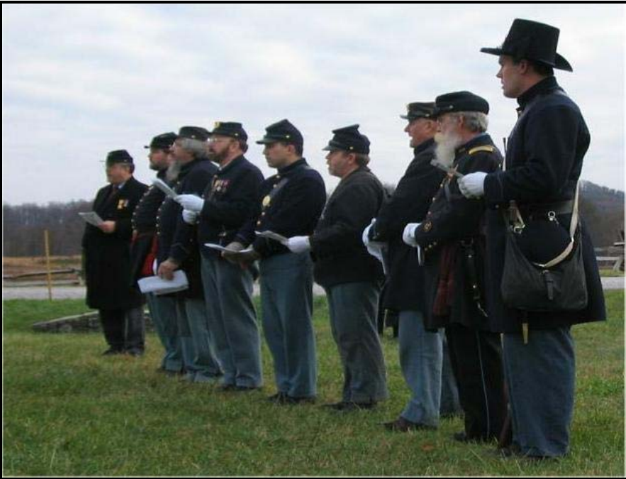
Department of Michigan Ceremony at Third Michigan Monument