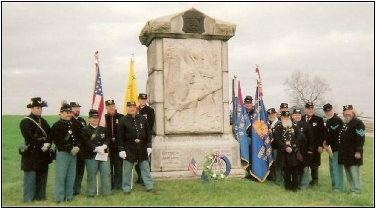
Department of Michigan Ceremony at Third Michigan Monument