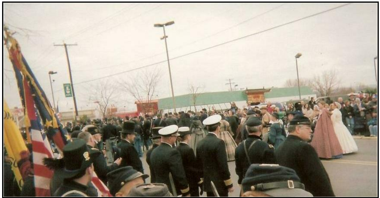
Part of the parades reviewing dignitaries including the Captain and two officers from the USS Gettysburg