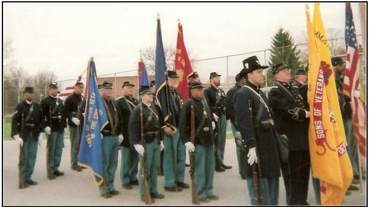
Most of the Michigan Color Guard for the Commander-in-Chief