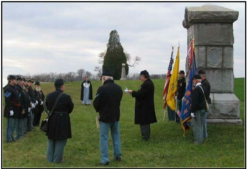
Department of Michigan Ceremony at Third Michigan Monument