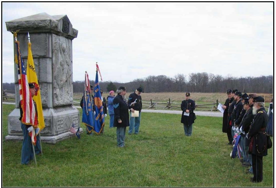
Department of Michigan Ceremony at Third Michigan Monument