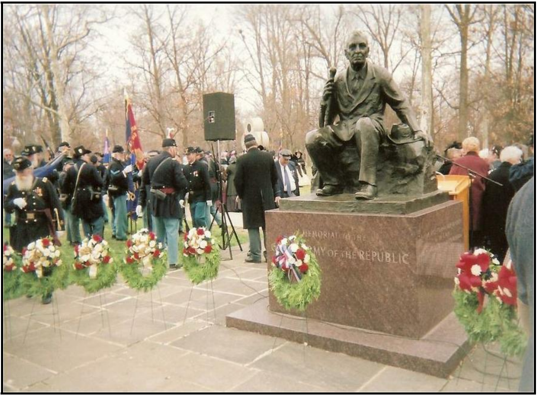
Woolson Grand Army of the Republic Monument