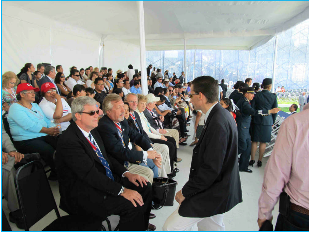
Portion of delegation at Grandstands