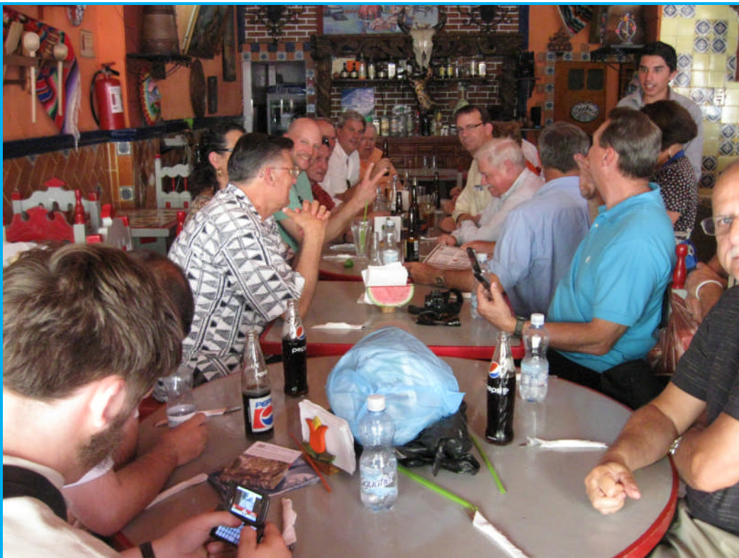
Lunch at Que Chula es Puebla