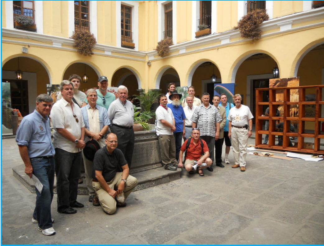
Delegation at Rosary Chappel.