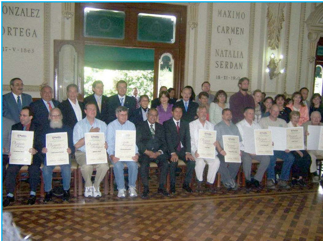
Puebla City Hall