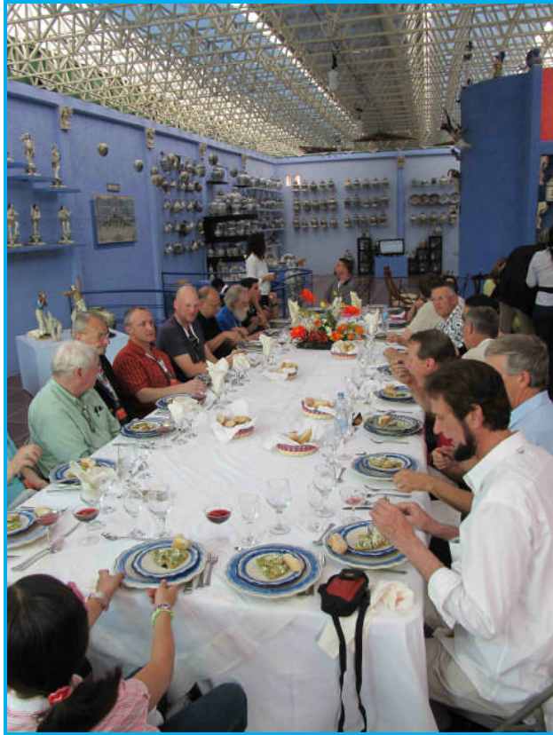
Dinner at Talavera Workshop