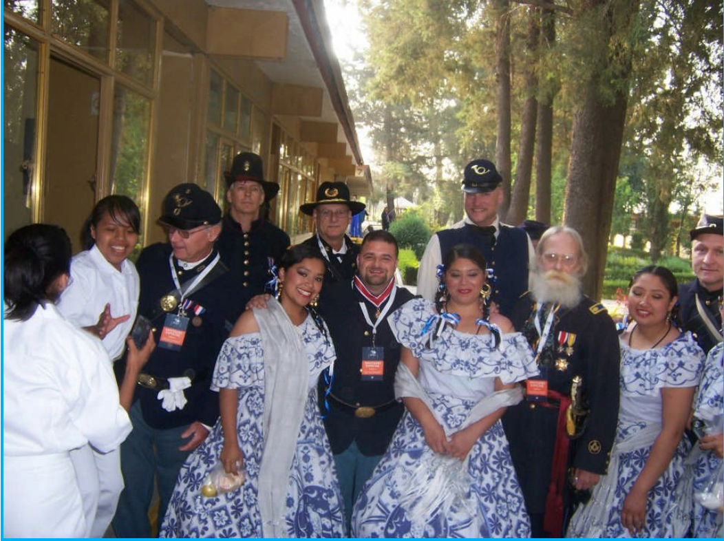
Parade Staging Area