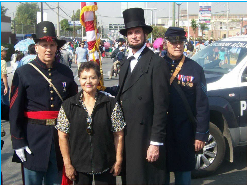
Parade Staging Area