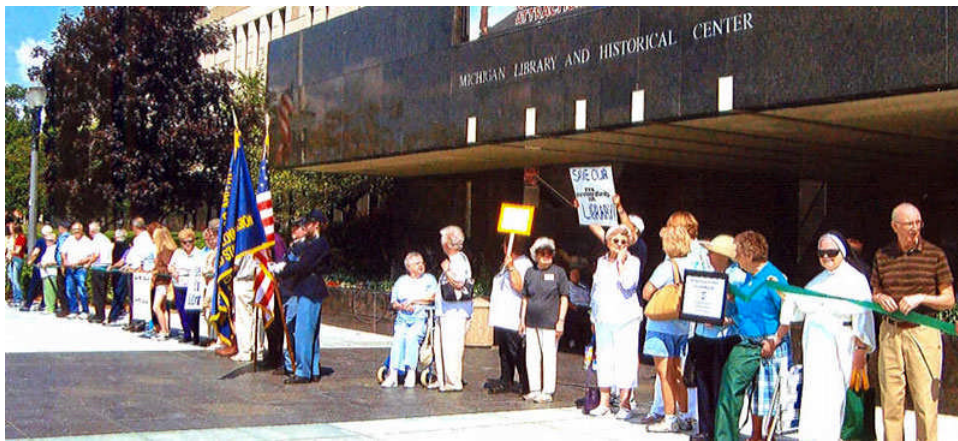
Supporters of the Library of Michigan formed "Hands Around The Library", surrounding the 1800' perimeter of the building. People from all walks of life and all age groups joined together to attempt to block the closing of this world class facility.