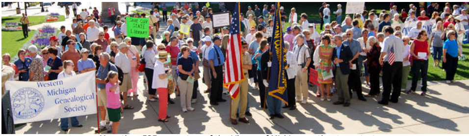
More than 525 supporters of the Library of Michigan gather to protest Governor Granholm's planned closing of Michigan's State library this Fall.

Unfortunately Governor Granholm was not in her office that day. While we were there trying to convince her to continue to spend the $2 million on the library, she was in Detroit with Vice President Joe Biden. They were discussing a plan to spend $1 billion on battery technology. We know that she is getting the message that we were there. You can help the cause even more by making sure that she is getting the message.