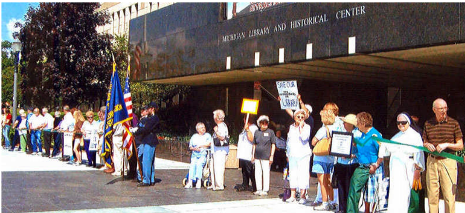
Supporters of the Library of Michigan formed "Hands Around The Library", surrounding the 1800' perimeter of the building. People from all walks of life and all age groups joined together to attempt to block the closing of this world class facility.

At one point during the rally 525 people were counted at the Library and we know that did not include everyone that was there.