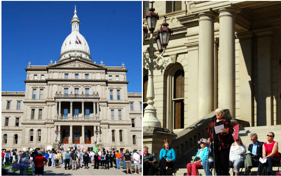
Protestors of the planned closing of the state library assembled in front of the state capitol building to make their case prior to proceeding to the Library of Michigan building to form "Hands Around the Library"