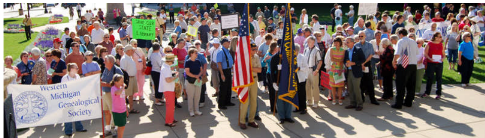
More than 525 supporters of the Library of Michigan gather to protest Governor Granholm's planned closing of Michigan's State library this Fall.