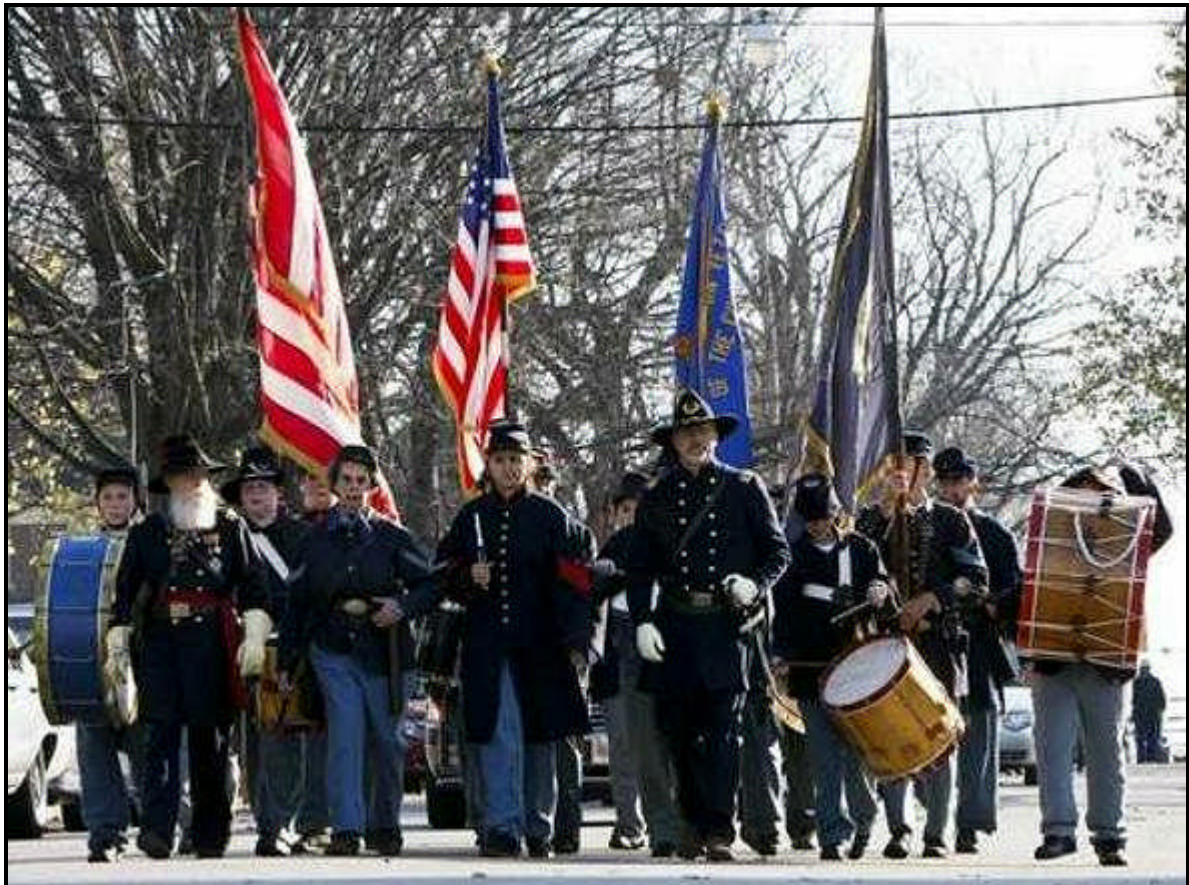
VETERAN'S MEMORIAL PARADE IN MASON