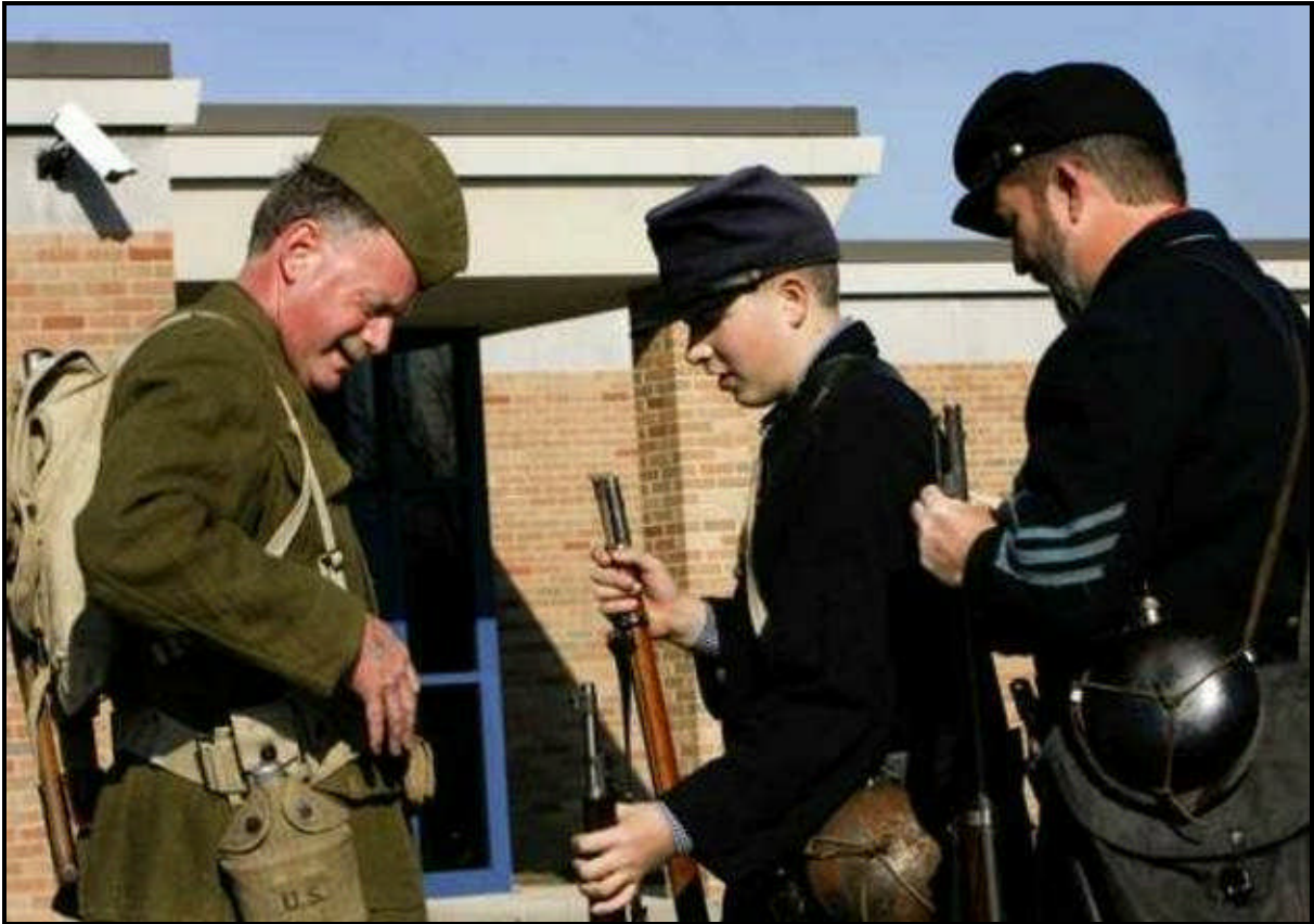
VETERAN'S MEMORIAL PARADE IN MASON