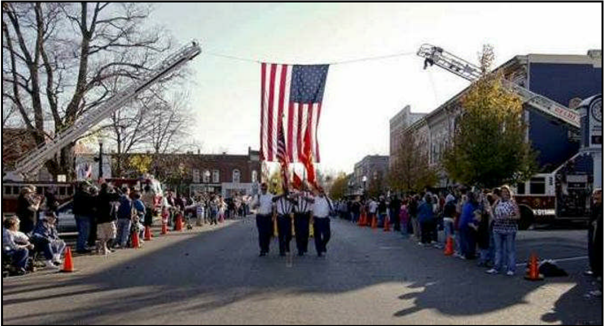
VETERAN'S MEMORIAL PARADE IN MASON US Armed Forces Veterans march in the Veteran's Memorial Parade Saturday afternoon in Mason